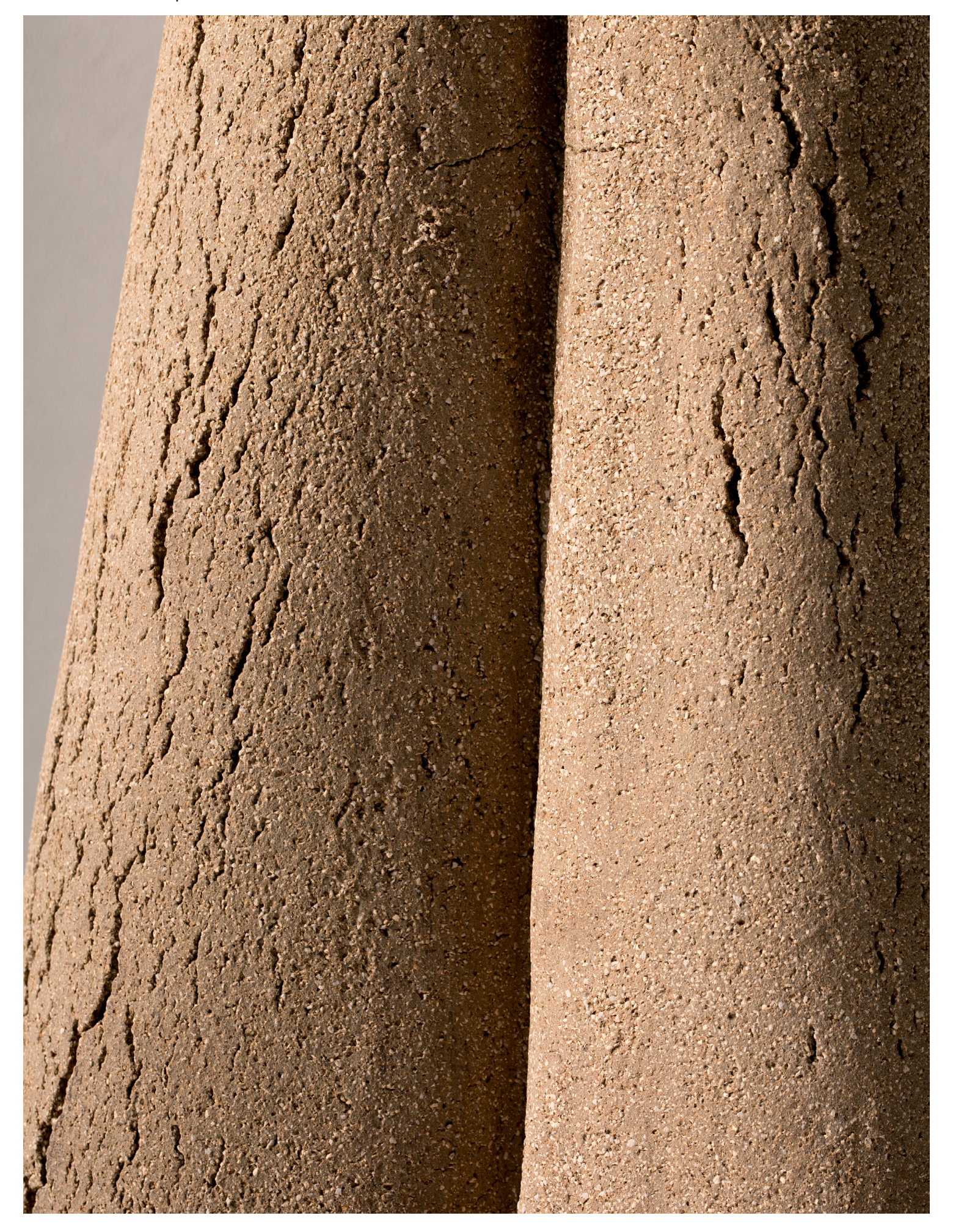
P Y MOBILIER