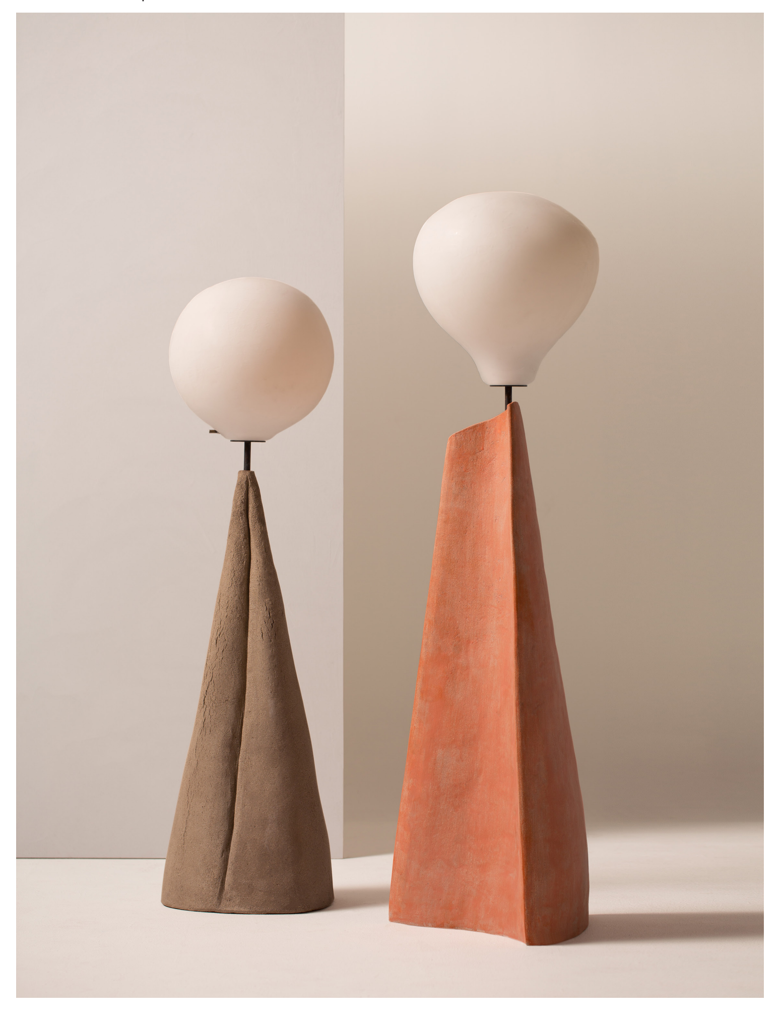
P Y MOBILIER