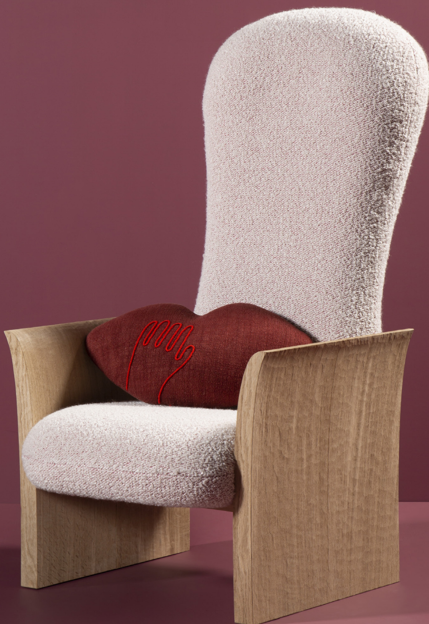
FLIRTING (High back) Armchair