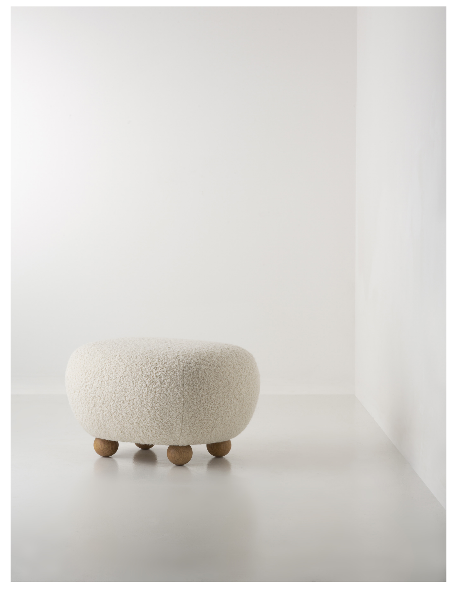
PIERRE YOVANOVITCH MOBILIER