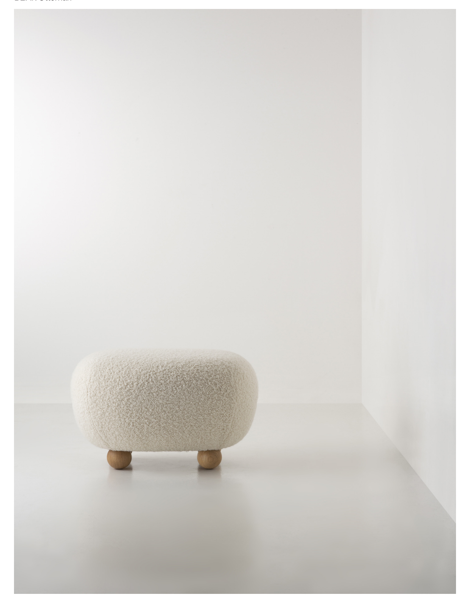
P Y MOBILIER