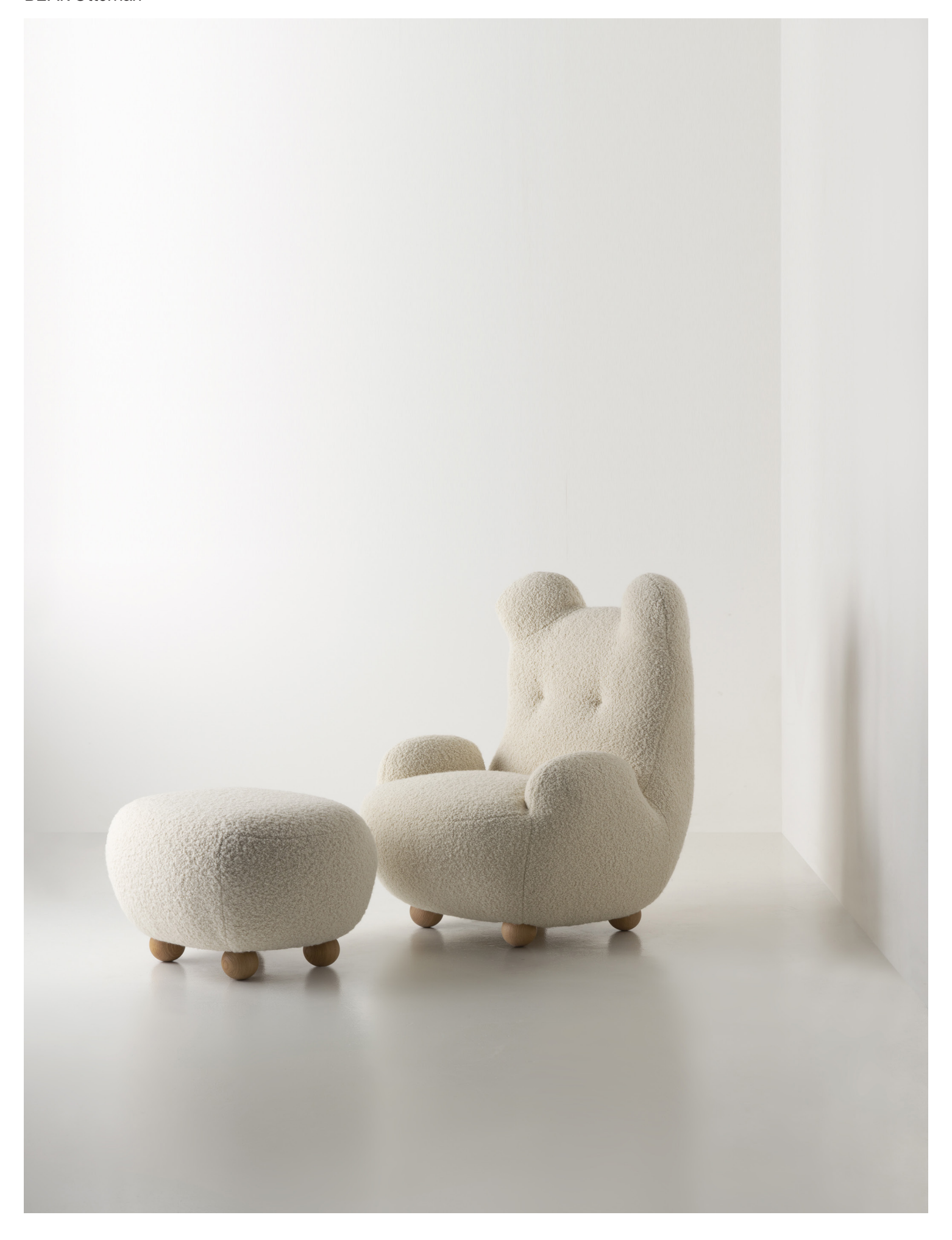
P Y MOBILIER