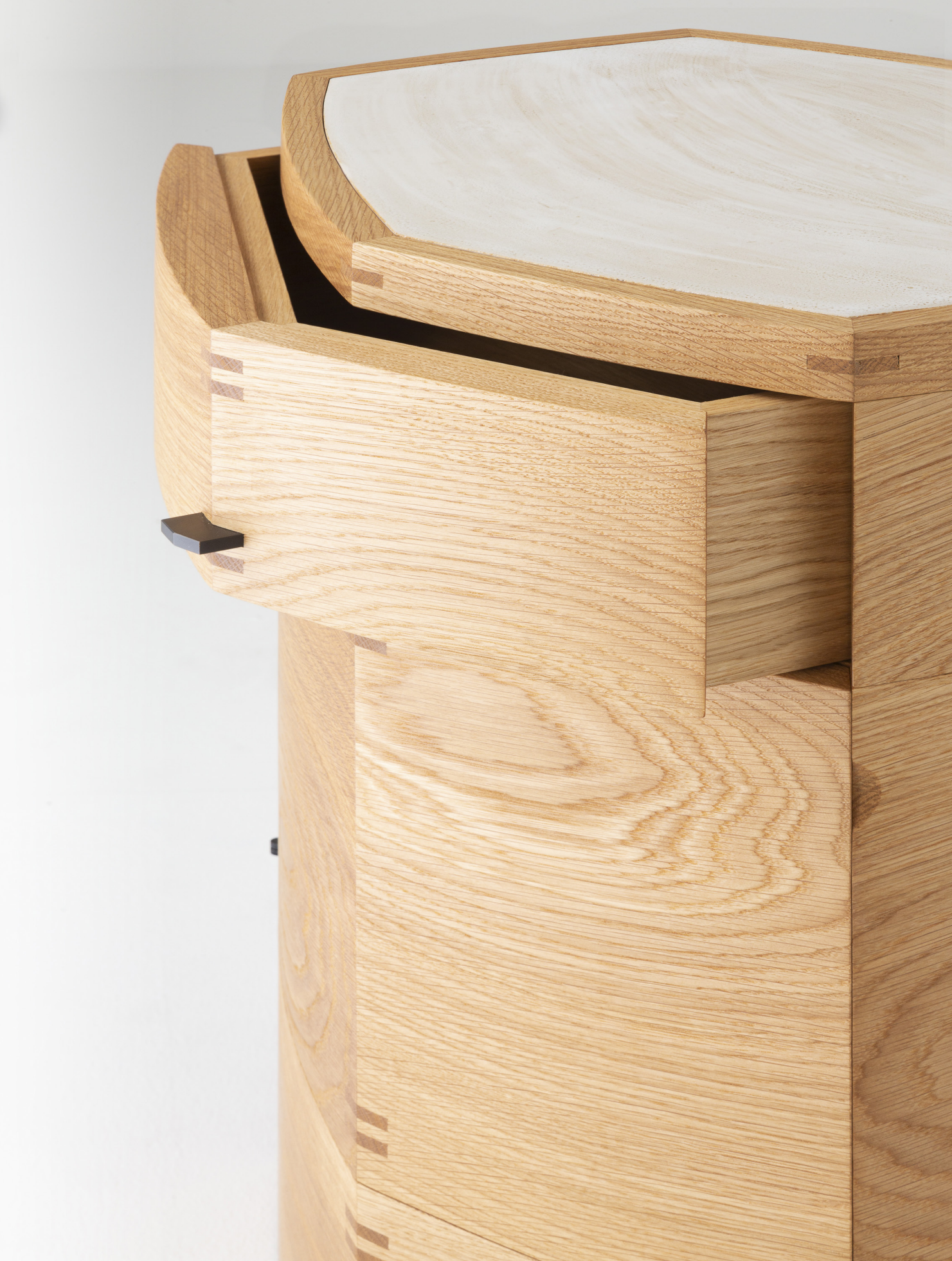
ELIE Bedside Table (ceramic)