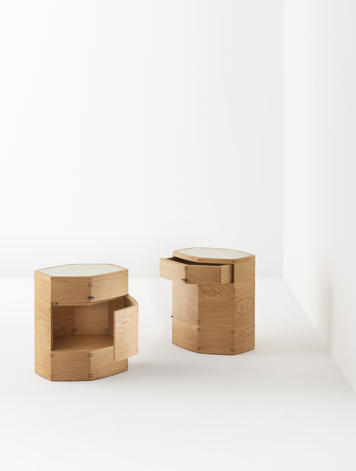
ELIE Bedside Table (ceramic)