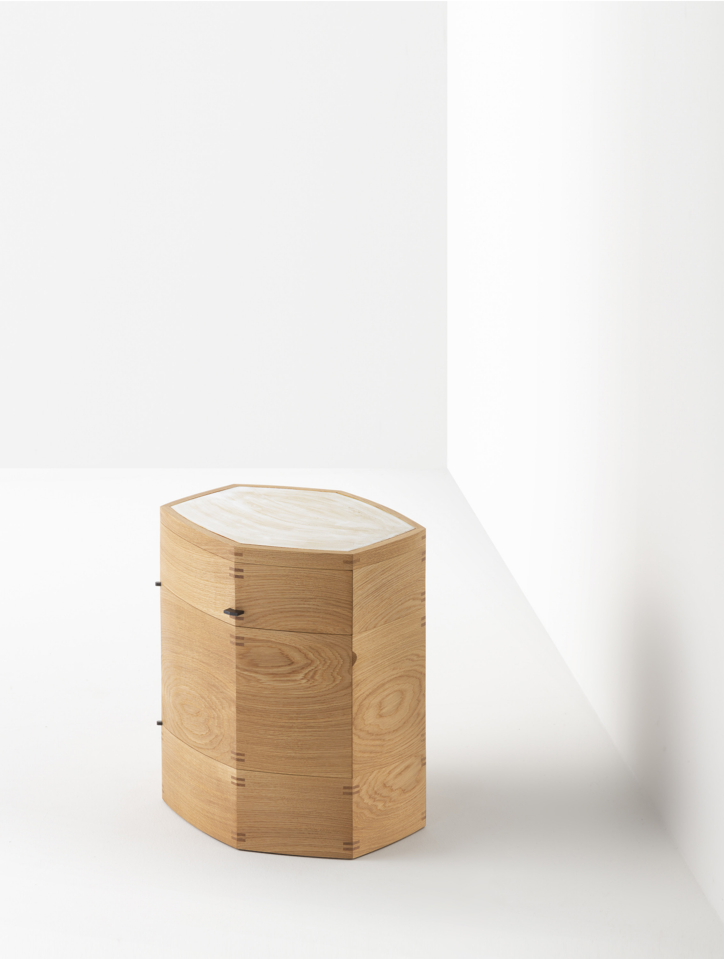
ELIE Bedside Table (ceramic)