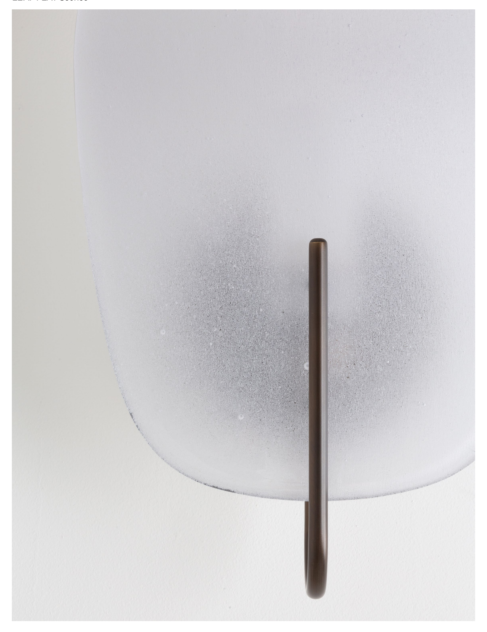
P Y MOBILIER