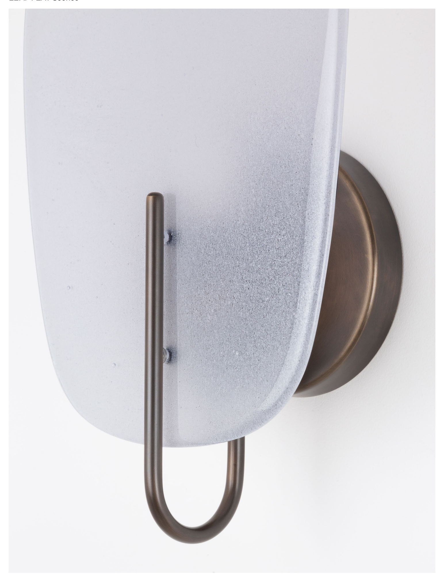
P Y MOBILIER