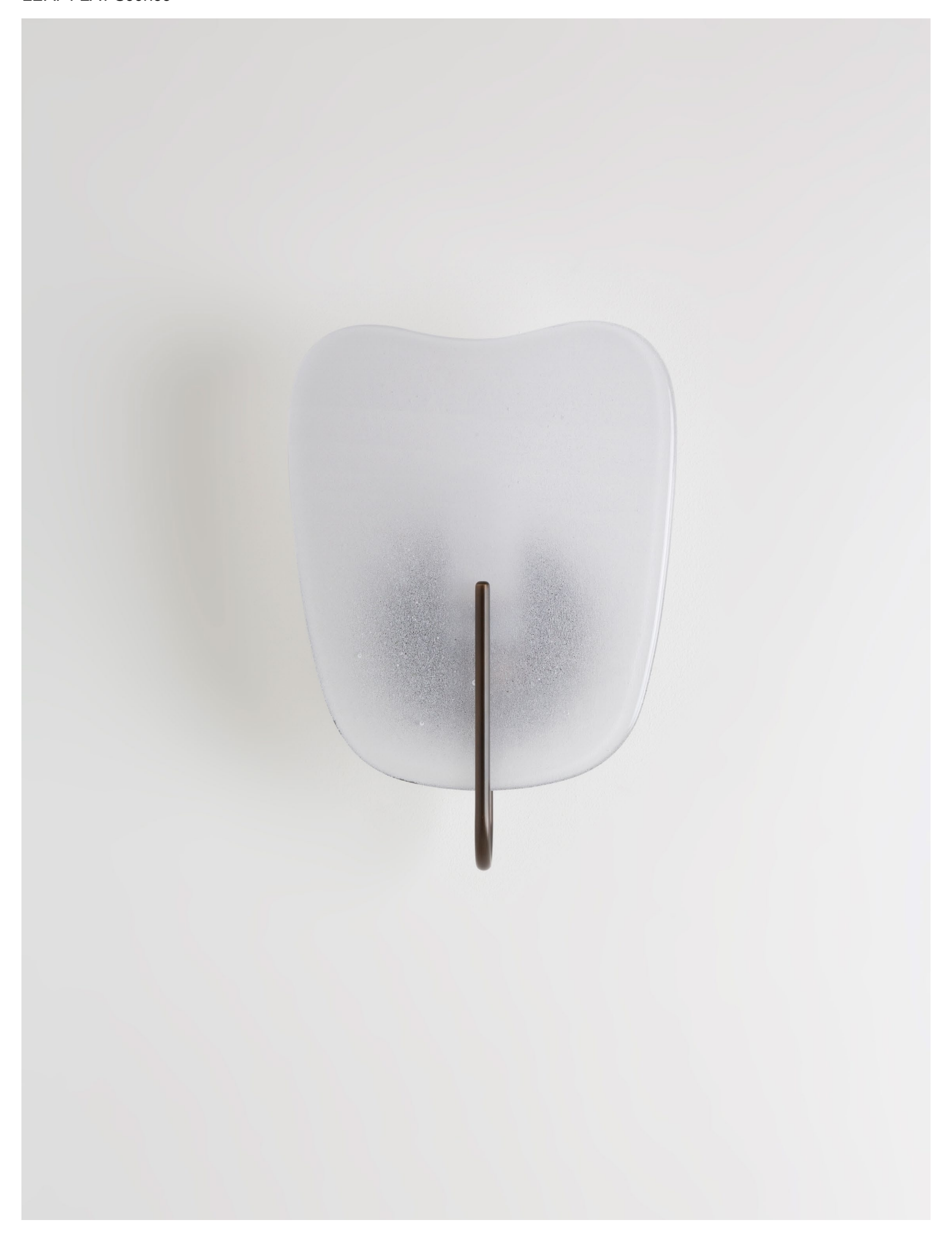
P Y MOBILIER