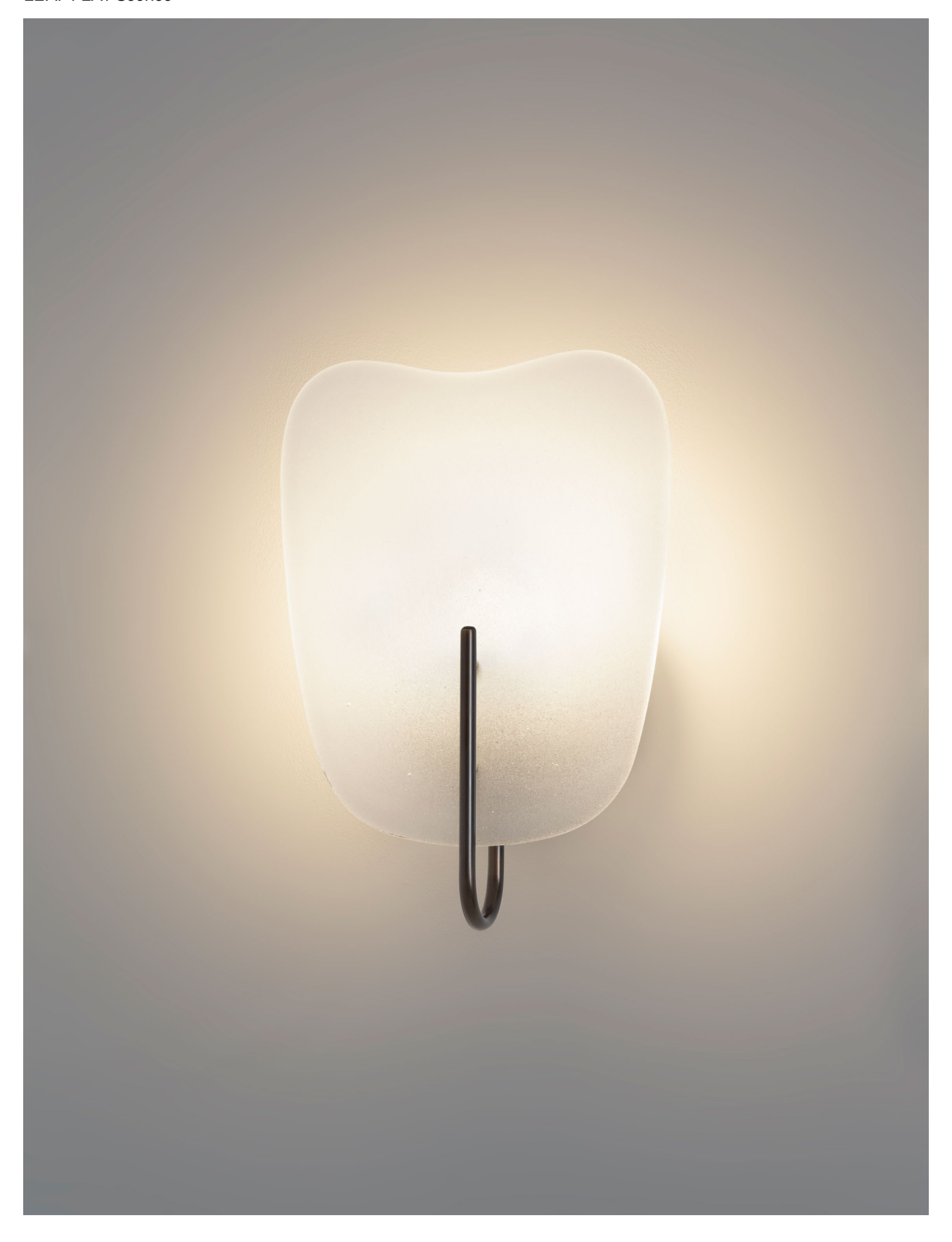
P Y MOBILIER