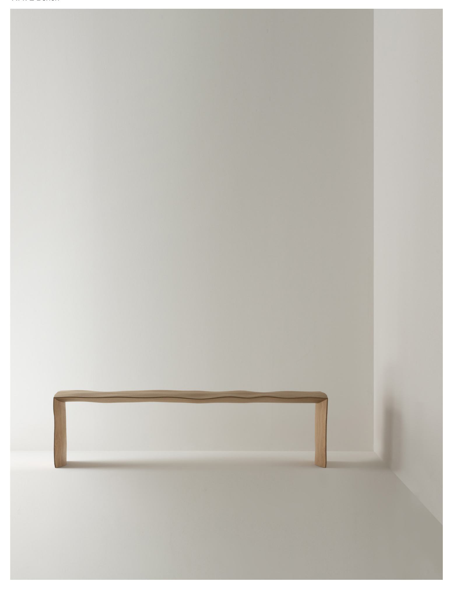
P Y MOBILIER