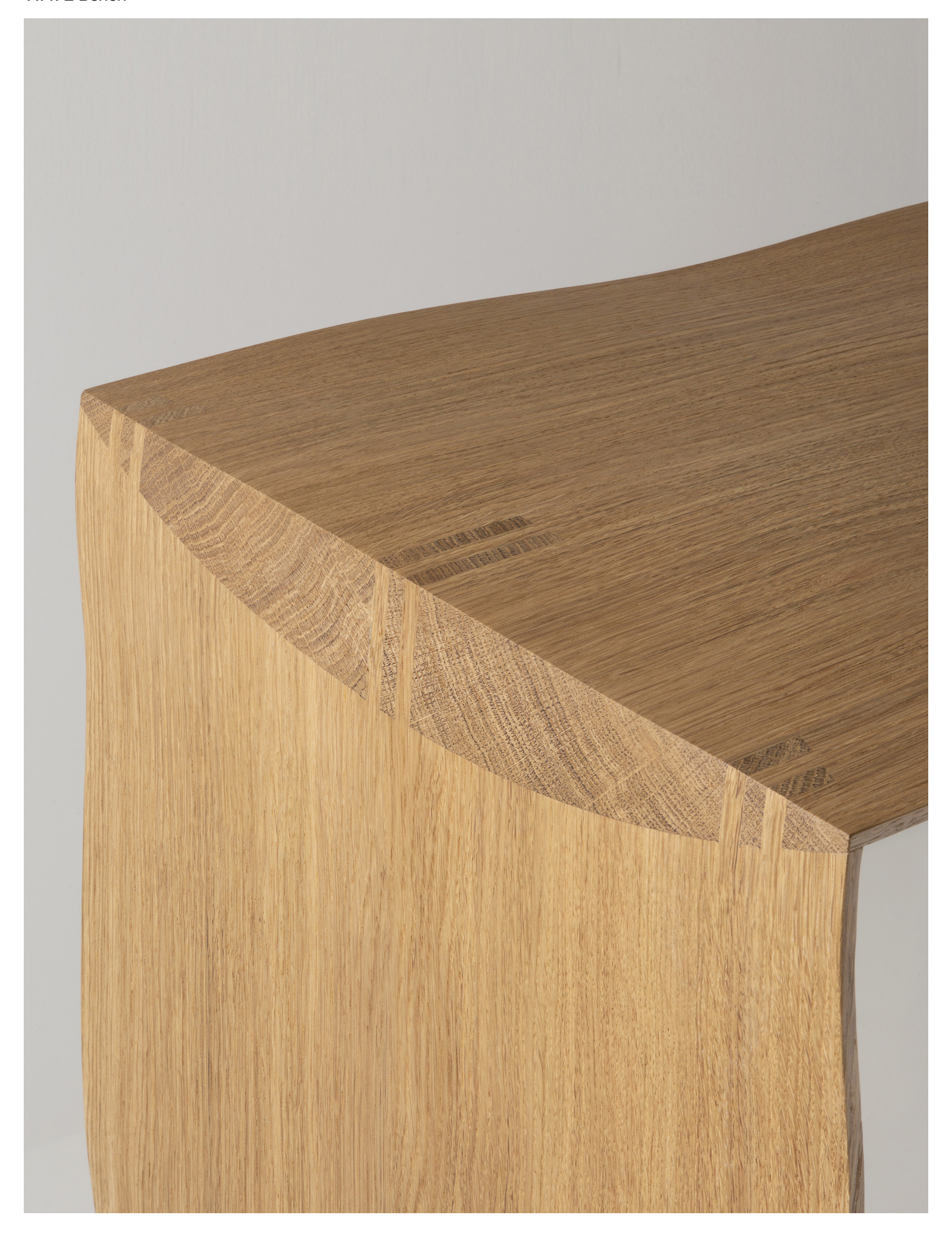
P Y MOBILIER