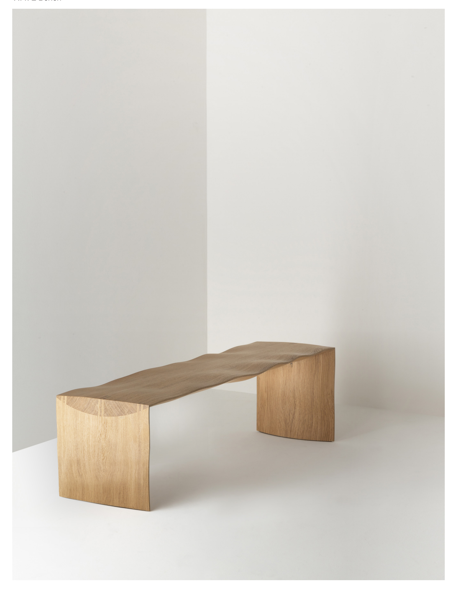
P Y MOBILIER