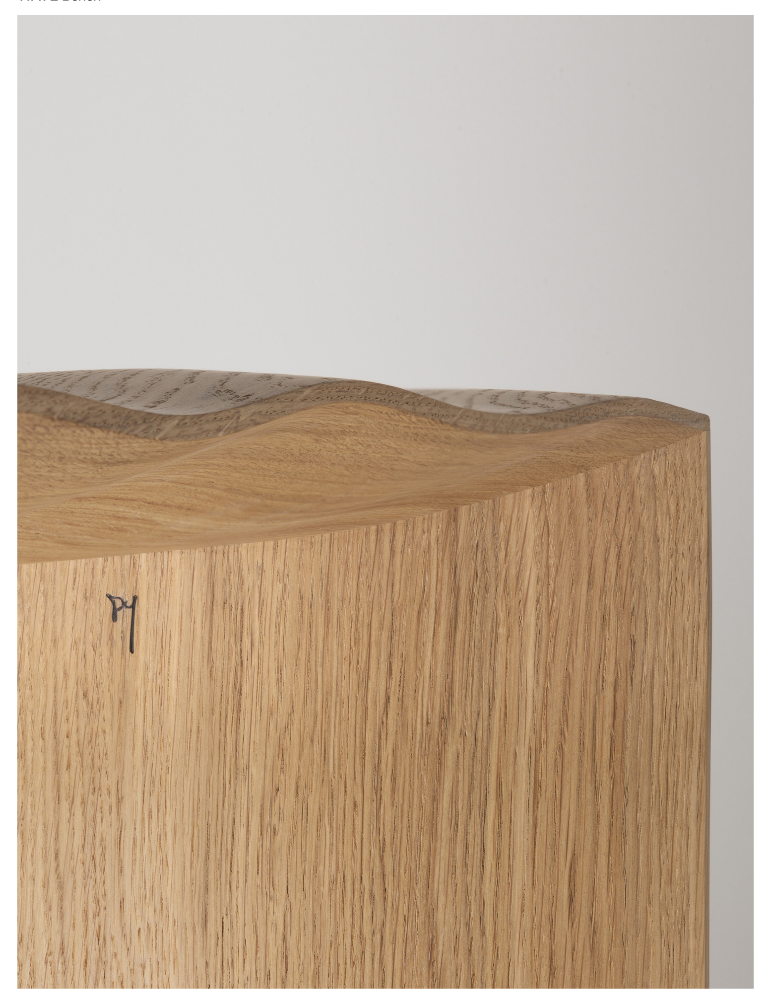
P Y MOBILIER