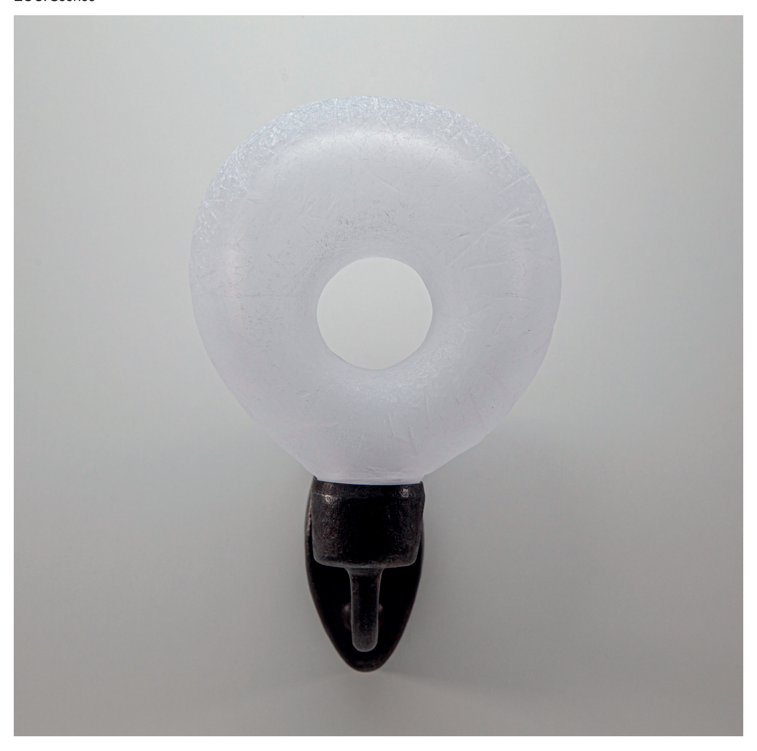
P Y MOBILIER