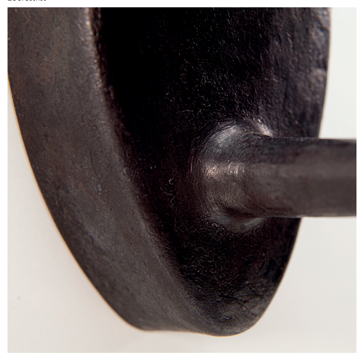
P Y MOBILIER