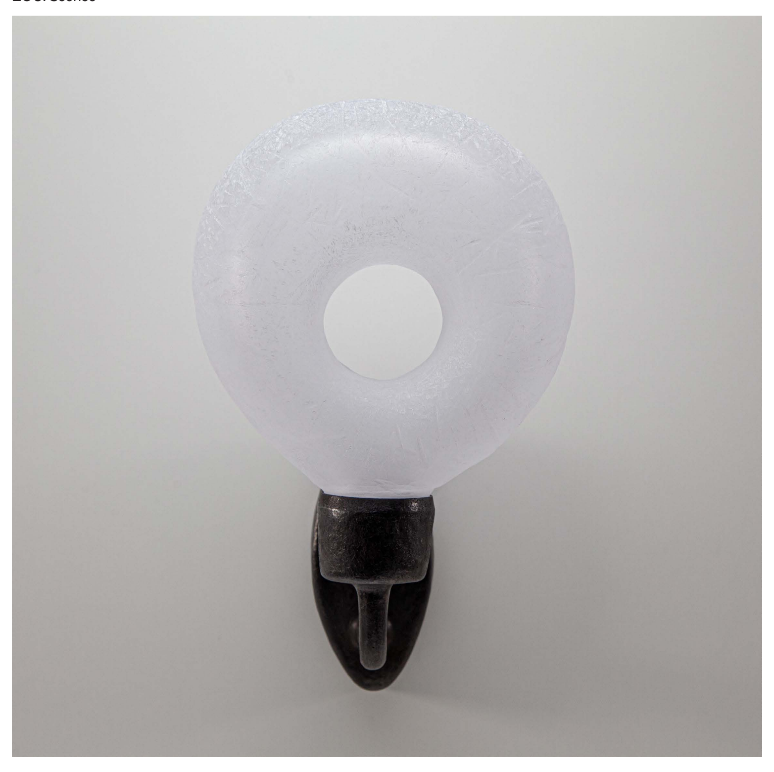
P Y MOBILIER