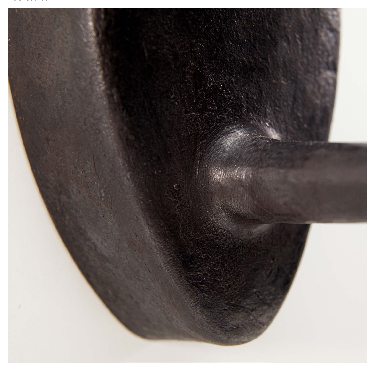
P Y MOBILIER