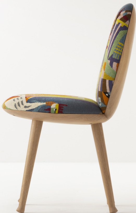
HEXA Chair (unique piece)