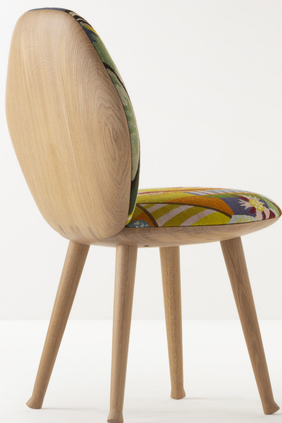
HEXA Chair (unique piece)