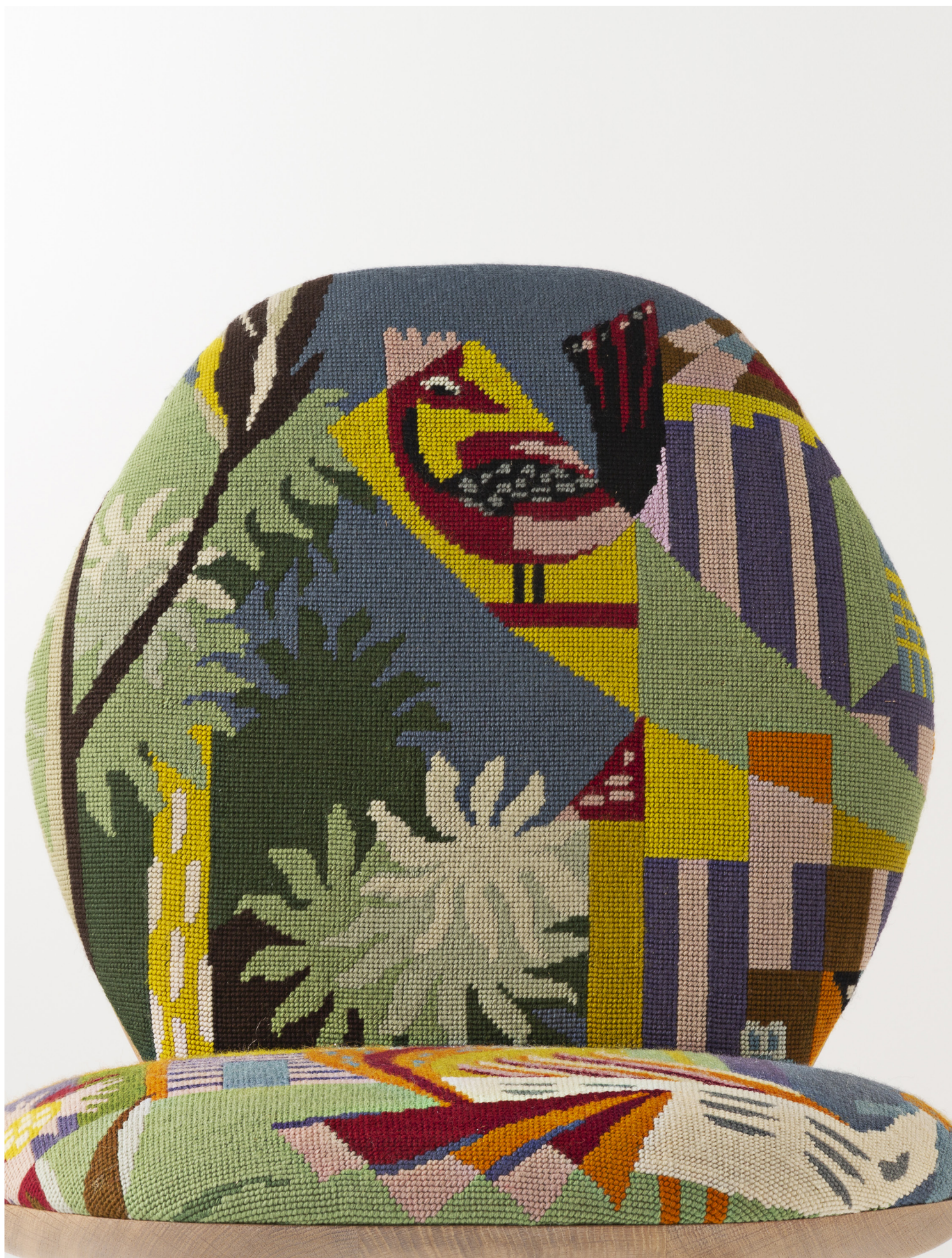
HEXA Chair (unique piece)