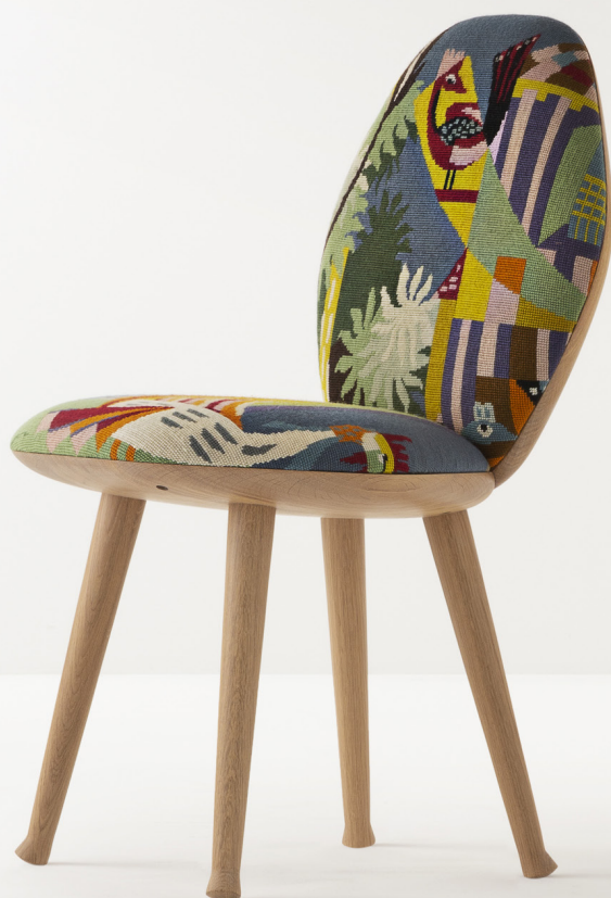
HEXA Chair (unique piece)