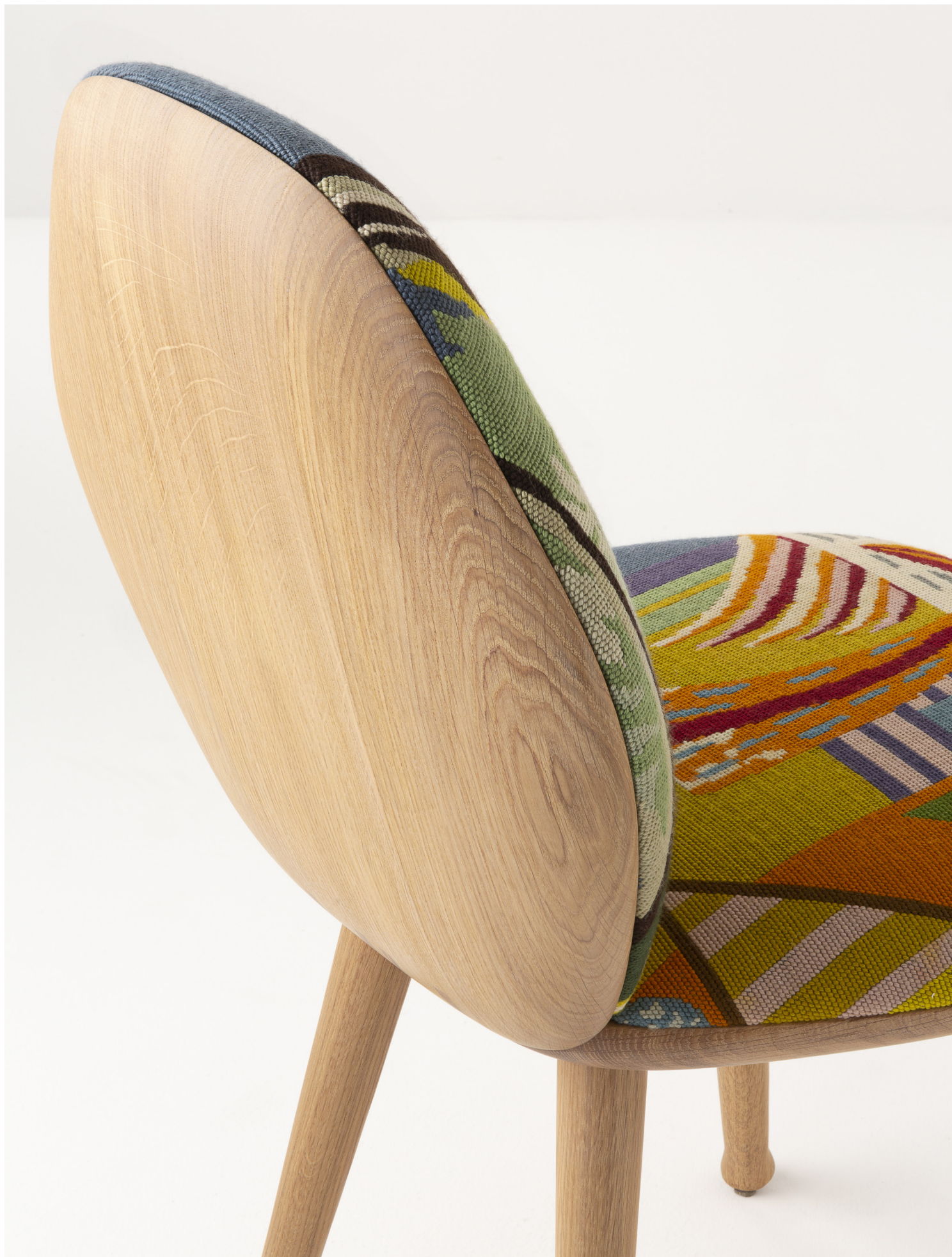
HEXA Chair (unique piece)