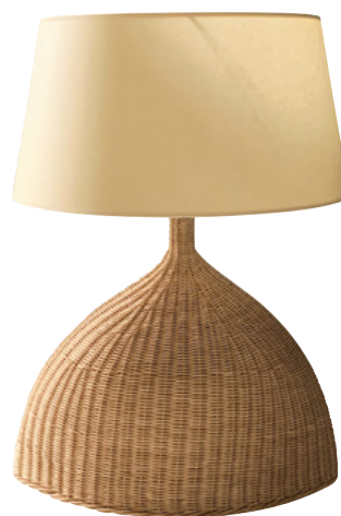
The Shape of Things LP Lamp by Atelier Vime Editions, $1,646, ateliervime.com