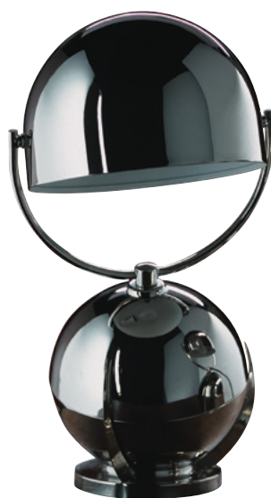
Mod Moment 1925 Lamp by Felix Aublet for Ecart International, $1,982, ecart.paris