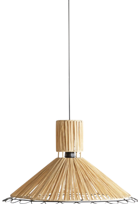
Natural Selection Ibiza Pendant by Honoré Deco, $165, honoredeco.shop