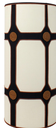
Graphic Arts Abat-Jour Colonne Lamp by Coline de Masure, $632, debeaulieu-paris.com

ILLUMINATE A lamp isn't just a lamp in the hands of the most brilliant French artisans and brands. Whether formed from hand-shaped clay, woven from straw, or modeled in sleek metal, these lights are to a room as the perfect handbag is to an outfit—they can pull the whole look together in one fell swoop.