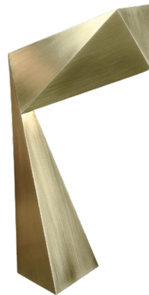
Cutting Edge Origami Table Lamp by François Champsaur for Pouenat, $10,500, lustare.com