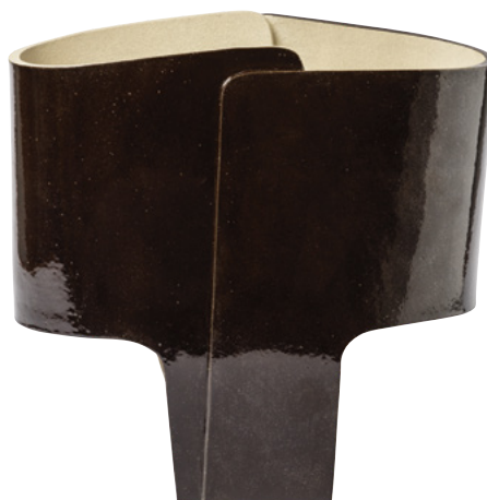
Film Noir Nocta Lamp VII by Denis Castaing for Kolkhoze, $1,702, kolkhoze.fr