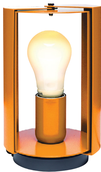
Lightbulb Effect Pivotante à Poser table lamp by Charlotte Perriand for Nemo Lighting, $383, hivemodern.com