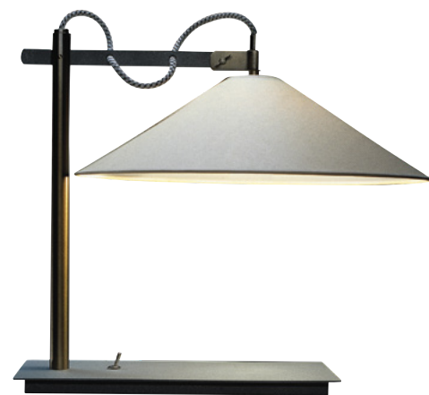
Task Master Kraft Lamp by Ecart International, $1,185, ecart.paris