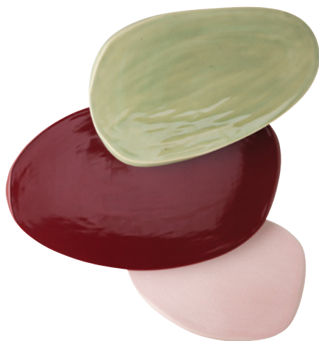
Color Fields Paw 1 Sconce by Pierre Yovanovitch, $8,000, pierreyovanovitch.com