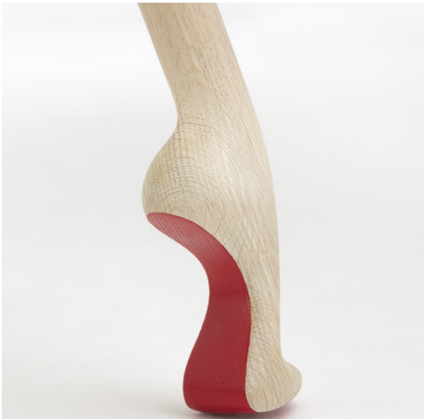
Red lacquered sole