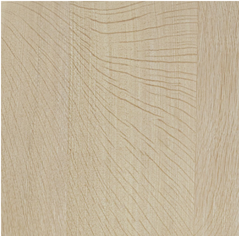
Bleached solid oak