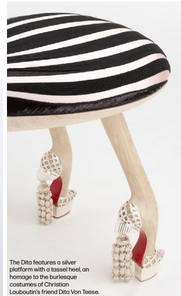
The Dita features a silver platform with a tassel heel, an homage to the burlesque costumes of Christian Louboutin's friend Dita Von Teese.